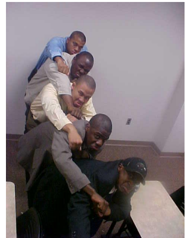
2005 Nu Eta Initiates

Fraternity, Inc. recently initiated five (5) new members. On January 13, 2005, The Five Demons of a Dogg-matic Cult were welcomed into the realm of