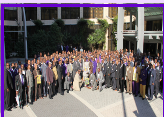
78th 7TH DISTRICT PHOTO MOBILE, ALABAMA

78TH 7TH District Meeting Pictures - pages 1-13